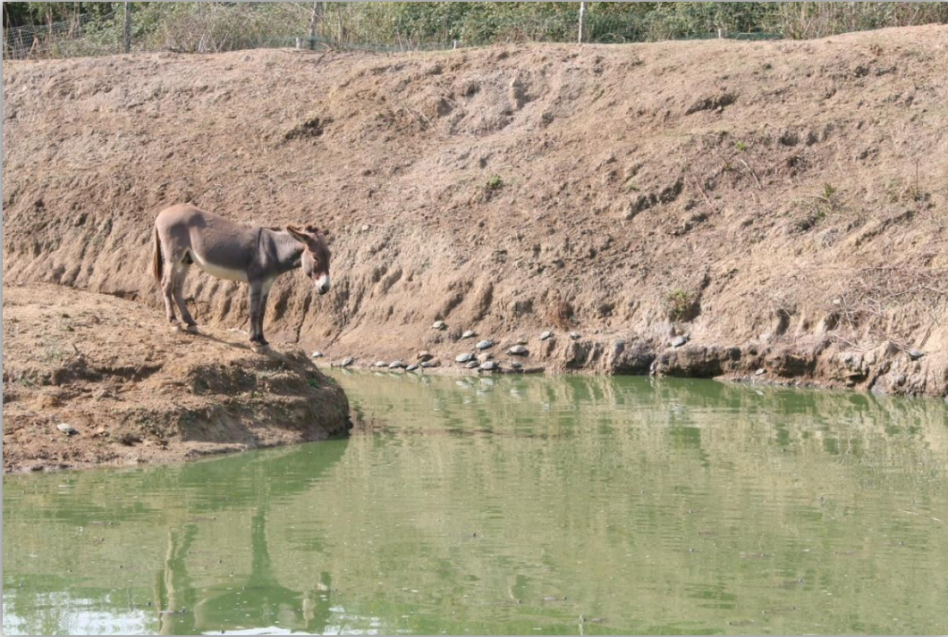
The first season following introduction of rehomed terrapins