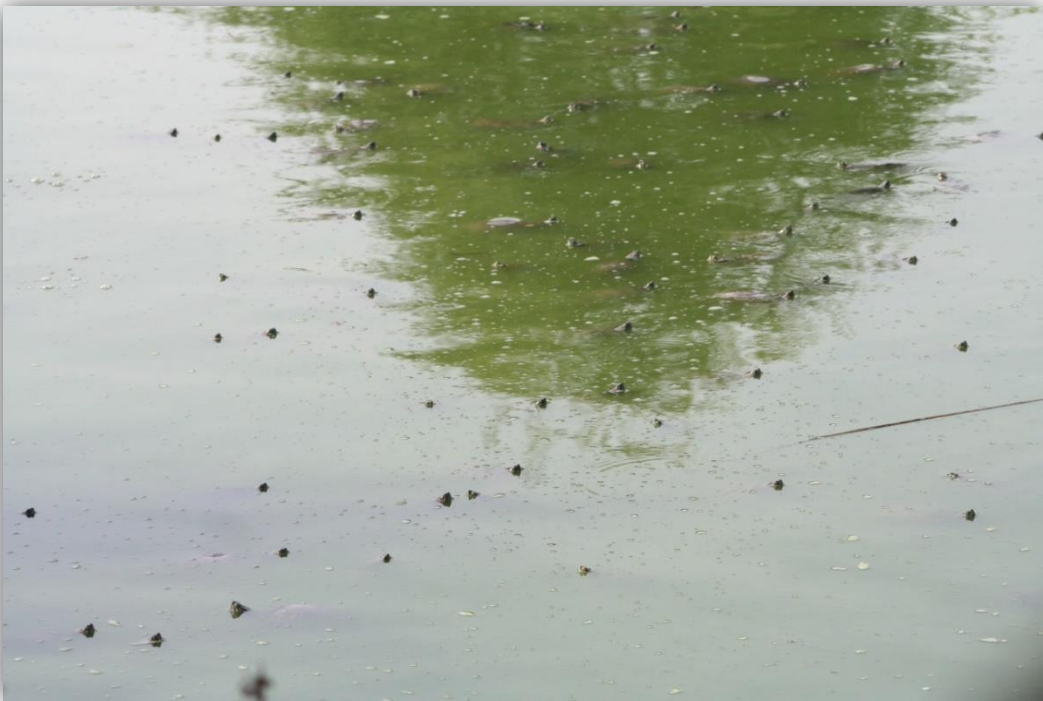
The pond surface showing many terrapin heads