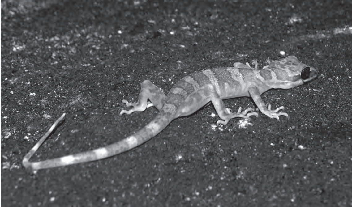
Figure 1. Cyrtodactylus sp. nov, Deer Cave, Gunung Mulu National Park.