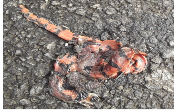
Figure 1. Road kill of Bibroni Coral snake.

This note reports on the discovery of a road-killed C. bibroni during field work on 24th August 2013 in Theppakadu at NH 66 in the Mudumalai Tiger Reserve (N 11.57712°, E 076.57072°) at an elevation of 894 m msl (Fig. 1). The snake was identified using descriptions