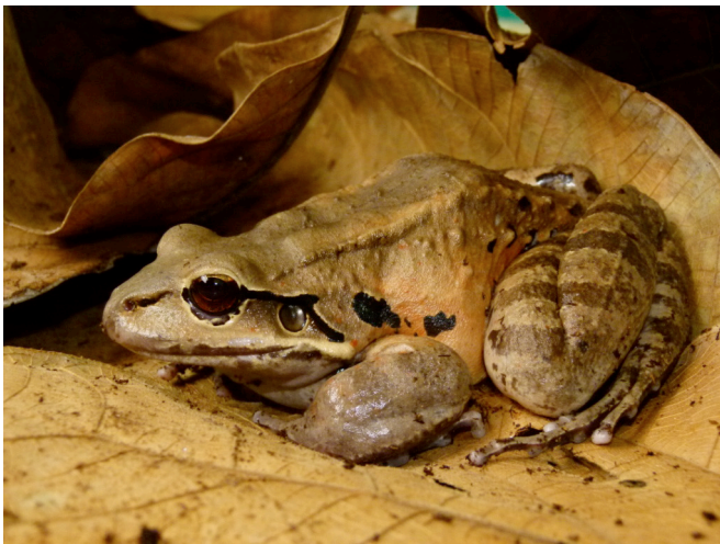
Figure 1. The mountain chicken ( Leptodactylus fallax )

Dominica was once the stronghold of one of the giants amongst frogs: the mountain chicken ( Leptodactylus fallax ). L. fallax is the largest amphibian in the Caribbean region (Fig. 1), and is currently listed as Critically Endangered by the IUCN (Fa et al., 2013). Currently, L. fallax is restricted to the islands of Dominica and Montserrat in the Eastern Caribbean; it was formerly far more widespread, occurring on seven Eastern Caribbean islands (Schwartz & Henderson, 1981). Island extinctions came about through a combination of habitat loss (forest and freshwater), introduced predators (especially rats and mongoose) and over-exploitation for food.