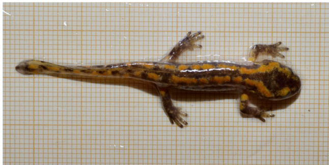
Figure 2. Prometamorphic larvae of Salamandra algira , found around Zitouna.