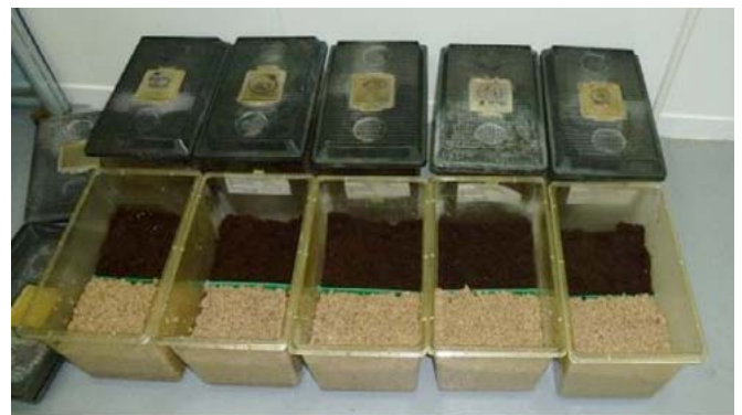
Figure 1. Choice chambers used to assess substrate preference in G. seraphini , with Megazorb to the front of each chamber and coir to the rear.

The position of each caecilian was recorded once every day between 09:00 and 16:00 hrs by gently lifting the choice chamber. Location could be established mostly without disturbing animals because parts could usually be seen through the clear base and/or sides of the chamber. Otherwise the position of each caecilian had to be established by sifting through the substrate in the choice chamber by hand. A control was not deemed appropriate in this study because health issues had been observed in animals that had been provided coir as a substrate. Because Megazorb had not previously been used as a substrate for caecilians it was not considered appropriate to house them on this substrate alone. The experiment ended after 39 days, on the ninth of February 2014, the G. seraphini were weighed and two separate groups transferred to enclosures with a Megazorb substrate.