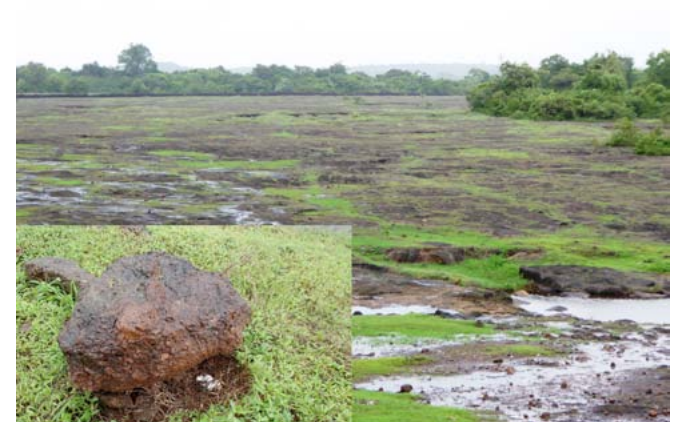
Figure 2. Rocky plateau habitat near Dhamapur comprising lateritic rock ground with sparse woody vegetation, scattered loose lateritic rocks, shallow soil depressions, temporary streams and pools. Insert: rock partially lifted to reveal A. stolatum eggs.

Previous observations by Wall (1925) recorded eggs of the species successfully hatching in a garden in Rangoon confirming that this snake will use semi-natural nesting sites. Our observation suggests that this unusual choice of deposition among lateritic rock by A. stolatum may be influenced by seasonality (wet season rains), prey availability (amphibians/tadpole in temporary pools), and/ or suitable foraging habitat. We also speculate that in this instance the snakes concerned may have chosen to lay eggs in an area with immediate prey availability in preference over traditional substrate as a way of potentially improving offspring survival.