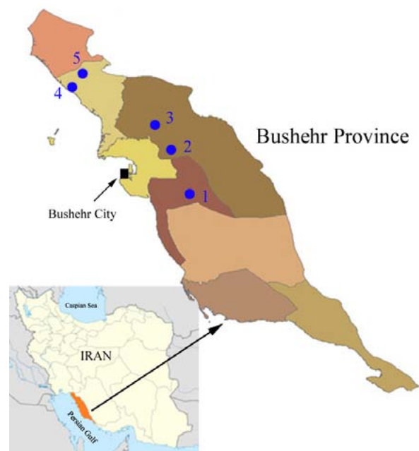
Figure 1. Map showing the location of Bushehr Province and the locations of the detailed areas (numbered 1-5) mentioned in the text

Field work was carried out in Bushehr Province, southern Iran. We listed all the areas in which we observed S. loricata . We then made a more detailed survey of the Genaveh area (Fig. 1). We delineated the potential range of the lizards based on previous reports and interviews with local people. Then we looked for lizards 8.00 and 10.00 a.m. local time and looked for signs (scats, feeding or resting signs and tracks) by hiking along trails and sometimes by using pseudo-random transects. We tried to visit all villages and interviewed more than 40 elderly local-born people,