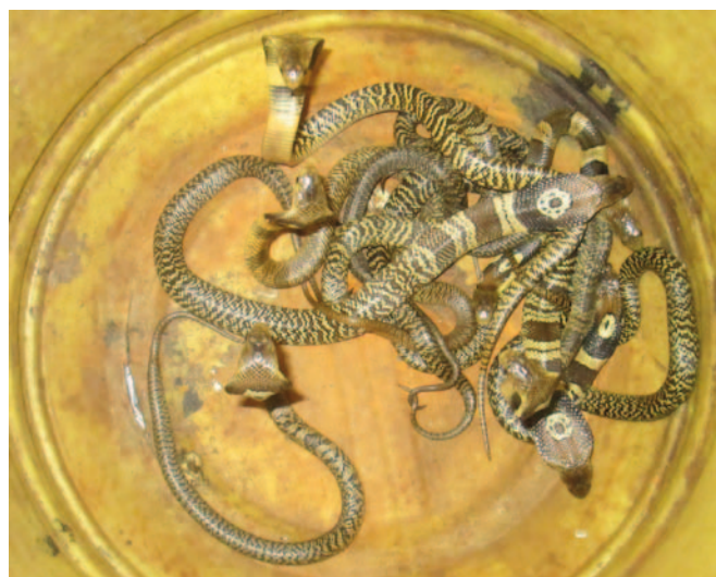
Figure 2. Juvenile N. kaouthia

having a SVL of 28 cm and a TL of 5 cm. The highest number of juveniles (N = 19) were rescued in November. The last five snakes were found on 1 - 2 December. The data are tabulated in Table 1. It was reported that baby cobras first emerge in late September and females observed guarding eggs from late July to August (Joydeb Sardar pers. comm.). No juveniles were reported between December to early February, presumably due to this being the hibernation period. The first individual to be found after winter was rescued on 14 March, 2017 with a SVL of 41 cm and TL of 7 cm. These data therefore suggest that N. kaouthia show a late rainy - early winter reproductive season in this area.