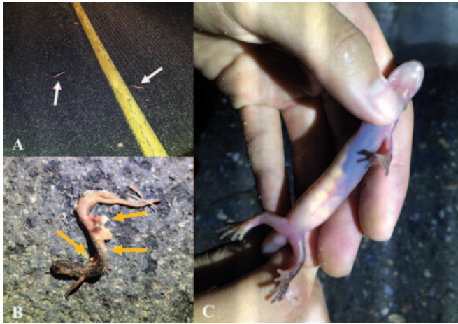
Figure 3. Some of the O. koreanus individuals observed on 11 and 12 October 2019 in Wangsan-ri, Gangneung, Republic of Korea- A. Two O. koreanus found sitting on the middle of the two-lane road (white arrows), B. Gravid female killed by a car, with developing eggs visible (yellow arrows), C. Gravid female found alive on the road with eggs visible through the transparent skin

Our observations are the first evidence of mass movement in O. koreanus , a salamander species endemic to the Korean peninsula. We also highlight the risk of road-kill associated with this event. We found that O. koreanus were coming down the mountain slope and crossing the road westward, towards the creek. In this process, the salamanders were forced to cross a two-lane road. As a result, many individuals were victims of road-kill. For safety reasons, the traffic on the road during our surveys prevented us from a thorough examination of the opposite lane (uphill / southward direction). It is likely that the salamanders we observed were not the only ones moving during those two nights and thus our figures for salamanders on the road and mortality are probably underestimated.