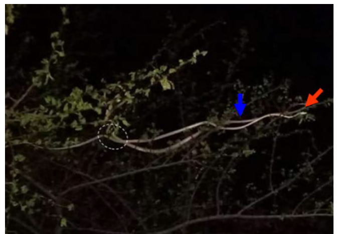
Figure 2. A courting male (blue arrow) and a female (red arrow) brown vine snake Oxybelis aeneus during a tail-search copulatory attempt (dashed circle) on a tree at night

90 minutes. At 19:20 h, one male and the female were seen together on the tree (Fig. 2). No copulation was observed, but some courtship-related behaviours were noted such as tactile-chase, tactile-alignment, and a tail-searching copulatory attempt (sensu Gillingham et al., 1977). The couple remained