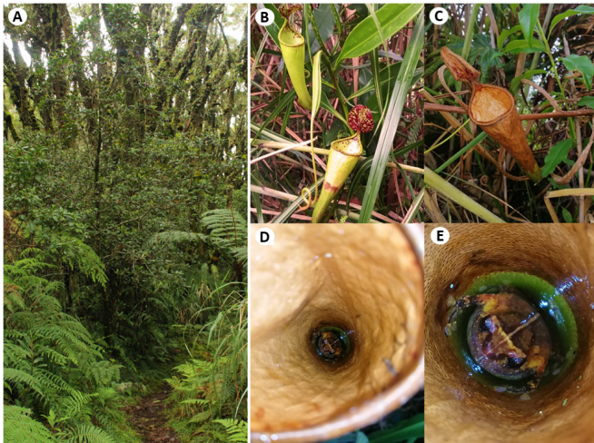
Figure 2. Observation of the frog Oreophryne anulata in a dormant pitcher of Nepenthes copelandii – A. Typical secondary montane forest habitat on Mt. Apo Natural Park, B. An active upper pitcher of N. copelandii , C. The dormant upper pitcher of N. copelandii in which O. anulata was found, D. O. anulata within the dormant pitcher, E. Close-up photo of O. anulata within the pitcher

In the Philippines, 115 species of anurans are currently recognised (Diesmos et al., 2015; 2020; Herr et al., 2021). Microhylid frogs are among these, and the genera Chaperina (Supsup et al., 2022) and Kaloula (Sanguila et al., 2016) are frequently linked to phytotelmata, but there are no previous reports of anurans using Nepenthes phytotelmata in the Philippines, apart from a dead toad Pelophryne albotaeniata that had probably drowned in a pitcher Nepenthes leonardoii on the island of Palawan (Sy & Tan, 2015).