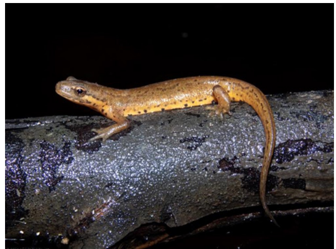
Figure 1. Female Caucasian smooth newt Lissotriton lantzi from northern Iran