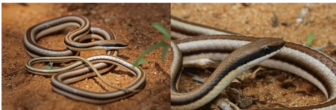
Figure 2. A specimen of Psammophis pulcher from a location at the edge of Tsavo NP

Kitui County, south of Mwingi National Reserve; altitude 536 m. Recorded on 29 April–1 May 2023 at various times of the day; we have chosen not to share location details to prevent poaching. Detailed information is available upon reasonable request; no specimens collected.