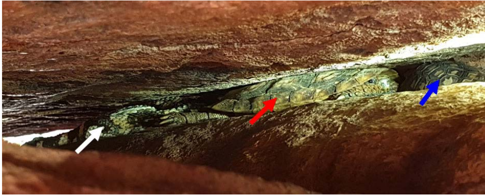
Figure 3. An adult (red arrow) and a subadult (blue arrow) Malacochersus tornieri sharing their shelter with a subadult Bitis arietans (white arrow)