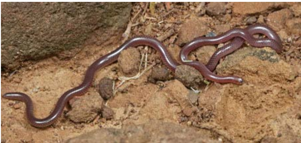
Figure 4. A specimen of Myriopholis macrorhyncha from Teddy Bear Island, Lake Baringo

Both specimens were found out in the open on a woodland trail and tentatively identified as M. macrorhyncha . They shared the same characteristics; body cylindrical and thin; head and neck slightly broadened; strongly hooked snout with distinct beak; tail tapering to a small blunt cone; dorsum unpigmented and pink coloured; venter cream coloured (Fig. 4). One specimen was more thoroughly identified based on the following characters: 14 rows of smooth subequal scales, 323 mid-dorsals; 31 subcaudals; total length (119 mm)-tail (10 mm) ratio=11.9; subtriangular cloaca shield; rostral moderate, much wider than nasals dorsally, not reaching level of eyes; large ocular with small eye centrally placed in upper half and moderate posterior supralabial; frontal, supraoculars, and postfrontal subequal, forming a rather floral-like rosette pattern; temporal single (Broadley & van Wallach, 2007).