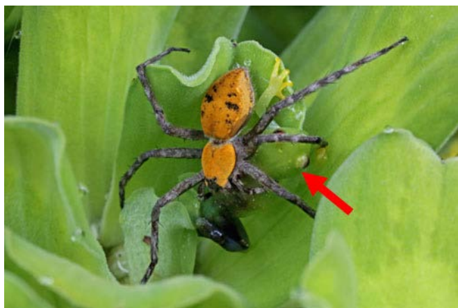
Figure 1. A specimen of Hyperolius pusillus (red arrow) predated by a pisaurid spider at a location on the edge of Tsavo NP

family in Africa, the exact identity is currently uncertain. We observed these spiders actively hunting for prey until one specimen caught an H. pusillus and started feeding on it (Fig. 1). This situation was observed for approximately one hour. By then, the frog was still alive, but body tissue around the area of the bite had become fluid. Predation of Hyperolius frogs and other frog species in the afrotropics by spiders has been reviewed by Babangenge et al. (2019). They mention that call sites favoured by H. pusillus make it particularly vulnerable to predation by pisaurid spiders (Minter et al., 2004), but until now no well-described cases of predation on H. pusillus have been published. Sympatric species of reptiles and amphibians that we recorded include Afrixalus delicatus Pickersgale, 1984, Kassina somalica Scortecci, 1932, Naja pallida Boulenger, 1896, Pelomedusa cf. neumanni Petzold et al., 2014 and Ptychadena mossambica (Peters, 1854).