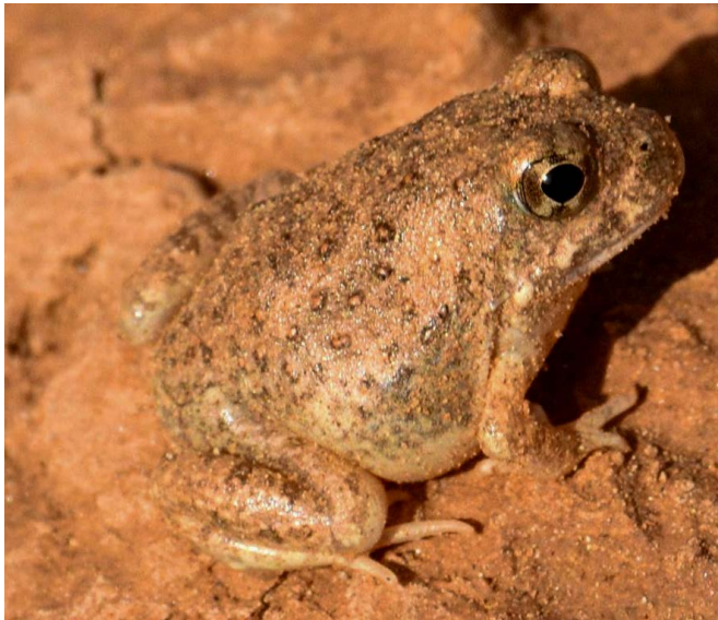
Figure 3. Adult Tomopterna milletihorsini from Timiaouine, southern Algeria

was lighter when compared to T. milletihorsini individuals examined from Mauritania (Escoriza & Ben Hassine, 2019).