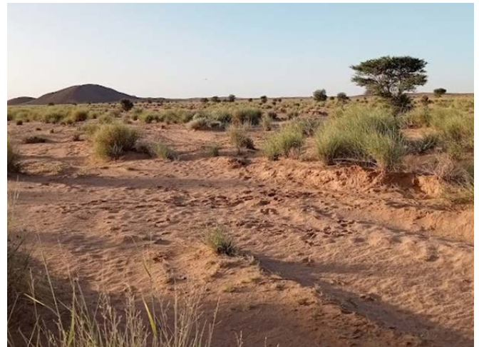
Figure 2. Acacia woodland habitat of Tomopterna milletihorsini in Timiaouine, southern Algeria

In 2022, during a fauna survey in southern Algeria, several individuals that could belong to this species were found in the Timiaouine region close to the Mali border (20.45° N, 1.85° E, 584 m. a.s.l.). The habitat was a typical Sahelian acacia savanna (Fig. 2). The small size (30 mm snout-urostyle), compact and robust build with short limbs and presence of a large, flange-like inner metatarsal tubercle on the feet all supported the assignment of these individuals to the genus Tomopterna (Escoriza & Ben Hassine, 2019) (Fig. 3). The short, vertical snout, absence of parotoids, tympanum not visible, vertically oval pupils with a small lower notch, and the presence of small tubercles scattered on the dorsum (in contrast to a densely rugous skin covered with spiny tubercles), all distinguished these individuals from other terrestrial Sahelian toads ( Sclerophrys xeros and Sclerophrys pentoni ). These Algerian individuals showed a uniform creamy brown dorsum with small, darker spots scattered across the back and limbs. Their overall colouration