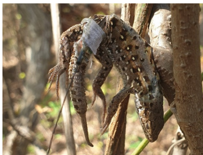
Figure 1. An impaled Mongolia racerunner, probably predated by a bull-headed shrike

On 30 September 2019 at 12:00 h, we attached a transmitter (0.35 g, BD-2X, Hologhil Systems Ltd, Canada) to 15 lizards and then released them on the coastal sand dune (36.412547 °N, 126.6375686 °E, WGS 84, 9 m a.s.l.) in Taean Province, the Republic of Korea. However, we lost the signal from one lizard at 15:00 h, which was the next tracking time. Then, at 12:00 h on 1 October, we found the