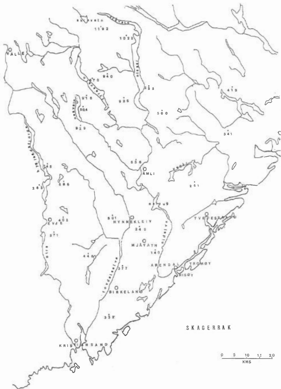
Fig. 1: o towns, villages, islands (upper case)