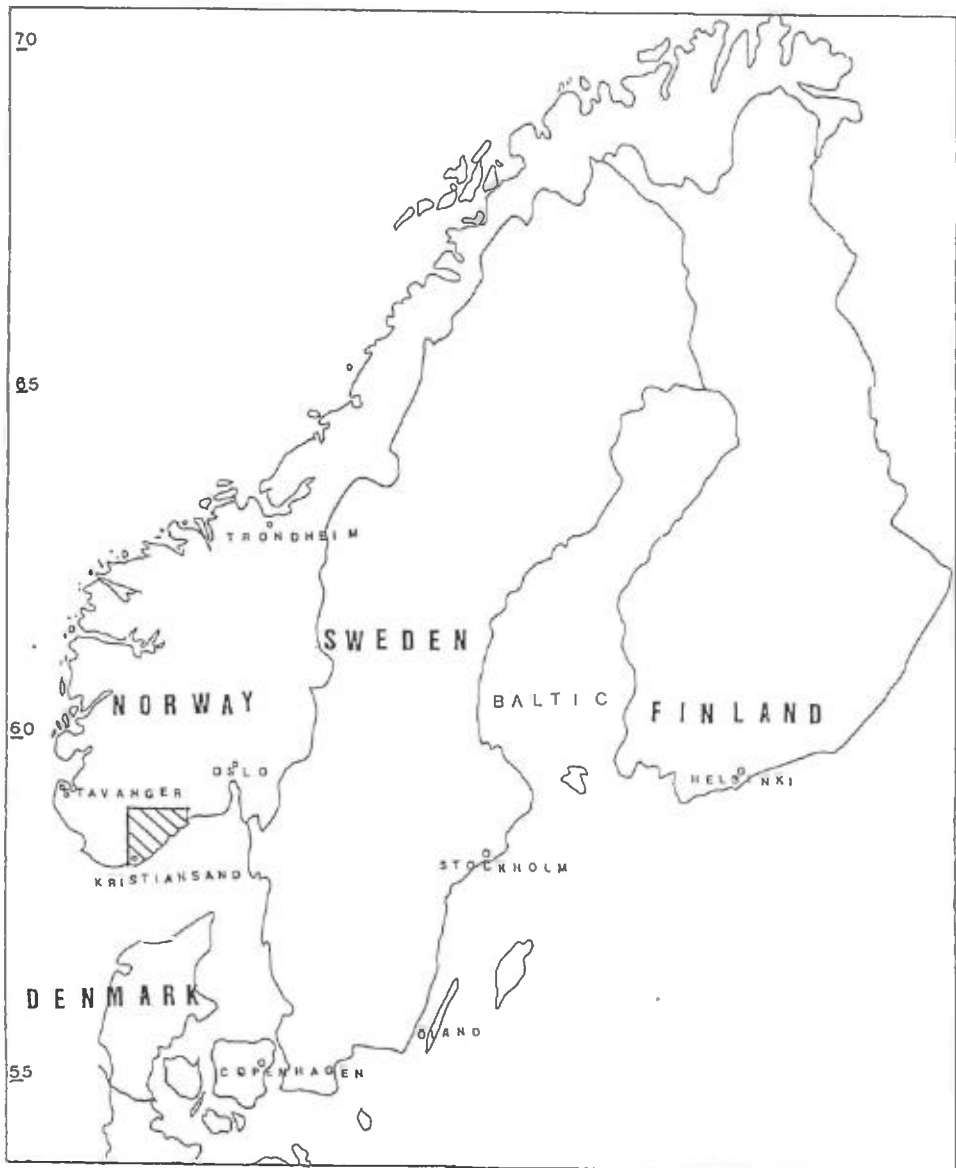
Fig. 2: Map of Denmark and Scandinavia – Area Covered In Report Cross-Hatched