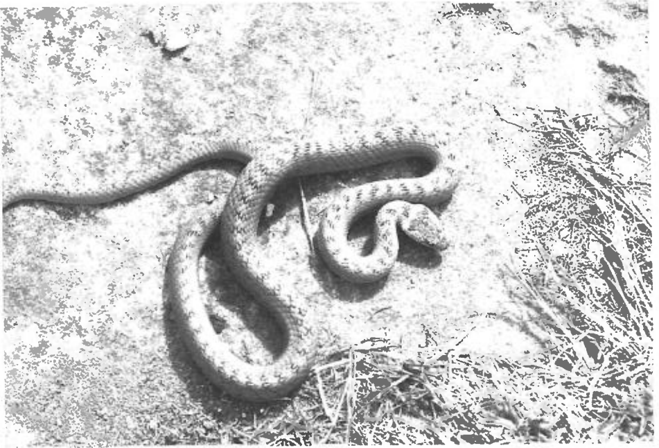
Plate 2: Coronella austriaca 55.5 cm male from Nesvatn