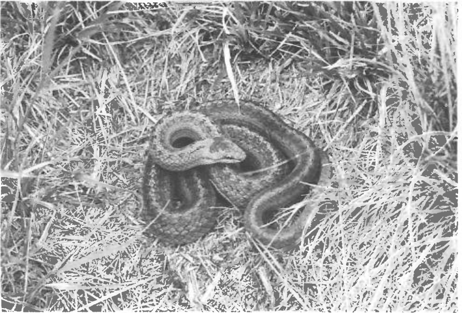
Plate 3: Coronella austriaca 64.5 cm male from Arendal

It is intended to pursue these investigations in the years to come as time allows. Norway is strongly recommended to all readers as a country to visit with the opportunity of observing the herpetofauna in unspoiled environments often set against great natural beauty.