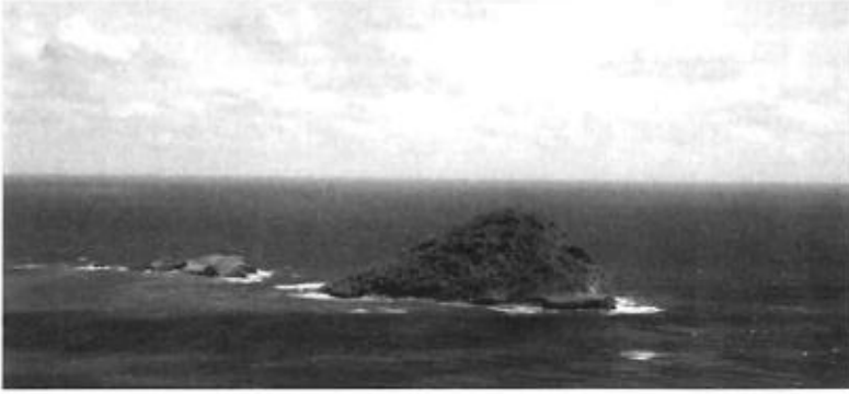
The Maria Islands.