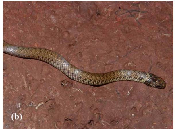
FIG. 3. Hatchlings specimens of L. miliaris orinus (206 mm TOL) (a) and L. miliaris semiaureus (244 mm TOL) (b), both with umbilical scars, caught between 30 and 28 January of 2000, respectively, from two localities separated by 170 km airline (see Fig. 1).

among them. L. m. semiaureus subpopulations from Paraguay-Argentina (our data) and Uruguay-South Brazil (Gans' data) were also grouped (Fig. 2). Most of the variation of canonical discriminant axis 1 is explained by number of ventral scales while most of the variation of axis 2 is explained by number of subcaudal scales (Table 3).