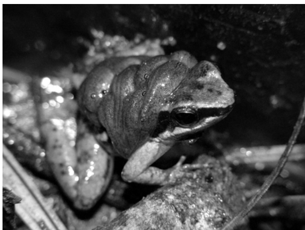
FIG 1. Mannophryne trinitatis male carrying larvae (eight larvae visible).

The stream frog Mannophryne trinitatis , Trinidad's only dendrobatid, occurs in and around small mountain streams (Murphy, 1997; Jowers & Downie, 2004). Calling males attract females to rocky crevices where eggs are laid and the males guard them until hatching. Males then transport the whole batch of larvae on their backs (Fig. 1) until a suitable pool or stream is found, where the tadpoles are deposited and then grow until metamorphosis (Wells, 1980). Downie et al. (2001) showed that an important characteristic in making a pool or stream suitable for deposition is the absence of tadpole predators, particularly the fish Rivulus hartii and the shrimp Macrobrachium carcinus . M. trinitatis carried their lar-