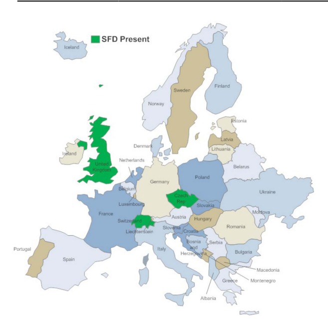
Figure 10. The distribution of ophidiomycosis cases in wild European snake populations.

several species ( T. marmoratus, A. obstetricans, L. boscai, S. salamandra, and B. spinusus, Rosa et al., 2017). The emergence of ranavirosis was correlated with sharp declines in two species ( L. boscai and A. obstetricans ) at one of the sites within Serra da Estrela Natural Park (Rosa et al., 2017). The ability of Ranavirus emergence in amphibians to change the species assemblages at a site and alter host community composition and structure is a huge threat to these animals (Rosa et al., 2017). Therefore, surveillance efforts must not just be centred around one potential pathogen or one potential host; a community-based approach for pathogen surveillance should be used whenever possible.