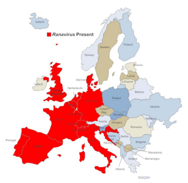
Figure 7. The distribution of Ranavirus spp. in wild European amphibian populations.

Table 4. Summary of countries and amphibian species known to harbour Ranavirus infections in wild European populations.