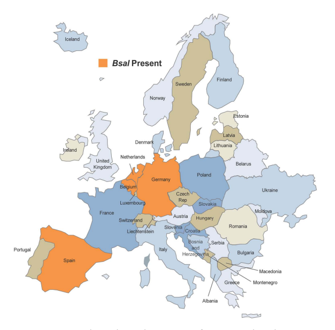
Figure 4. The distribution of Batrachochytrium salamandrivorans ( Bsal ) in wild European amphibian populations.

to ensure that Bsal is not present within the country. Ongoing surveillance is needed to ensure the emergence of Bsal is not missed in areas where it has not yet been recorded in the wild. This surveillance can be either active or passive, depending on the time and resources available. Recently in the UK, 2,409 swabs collected from wild newts in 2011 and 43 newts submitted for postmortem examination (between March 2013-December 2017) all tested negative for Bsal (Cunningham et al., 2019). However, there is experimental evidence to suggest that salamanders infected with low loads of Bsal may go undetected due to latency in detection via qPCR (Thomas et al., 2018). Due to the nature of the pathogen, screening should be completed regularly, especially of those populations that are deemed most vulnerable to ensure that there are no false negatives. In addition to this, to prevent the spread of the pathogen within Europe from captive collections, we advocate the trade in captive bred, certified disease-free salamanders only. Furthermore, the use of the early warning system developed for Bsal in Europe should be used (see below for more information).