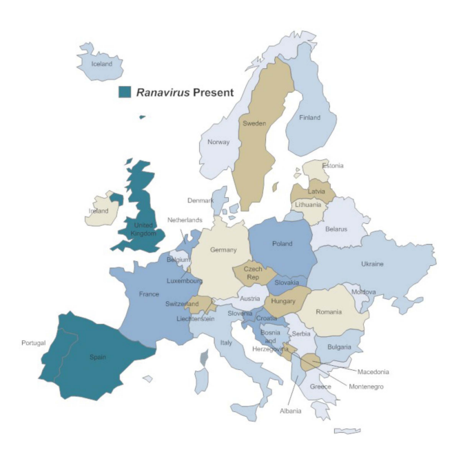
Figure 11. The distribution of Ranavirus spp. in wild European reptile species.

endemic disease that has become more virulent due to recent changes or whether it is introduced. Genetic work conducted by Franklinos et al. (2017) demonstrates that the strains of ophidiomycosis in Europe are different to those in the US, but again further research is needed to fully understand this relationship.