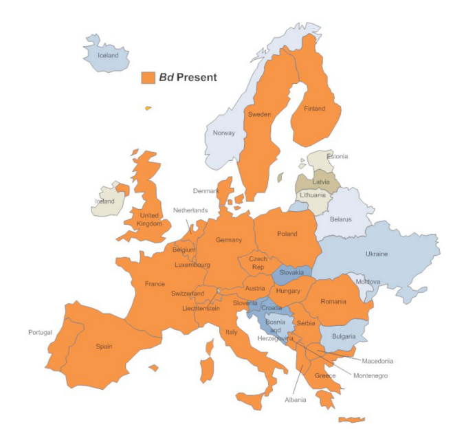
Figure 2. The distribution of Batrachochytrium dendrobatidis (Bd) in wild European amphibian populations.

Figure 1. A common midwife toad (A. obstetricians) that died because of Bd caused chytridiomycosis. Note the strange position of the legs, due to muscle spasms and the reddish hue of the vent and thighs.