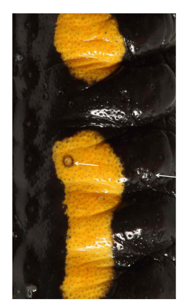
Figure 3. Close up of the skink of a fire salamander ( S. salamandra ) that died because of Bsal caused chytridiomycosis. Note the skin erosion with black margins indicated by the white arrows.

At this time, Bsal is limited to wild populations in