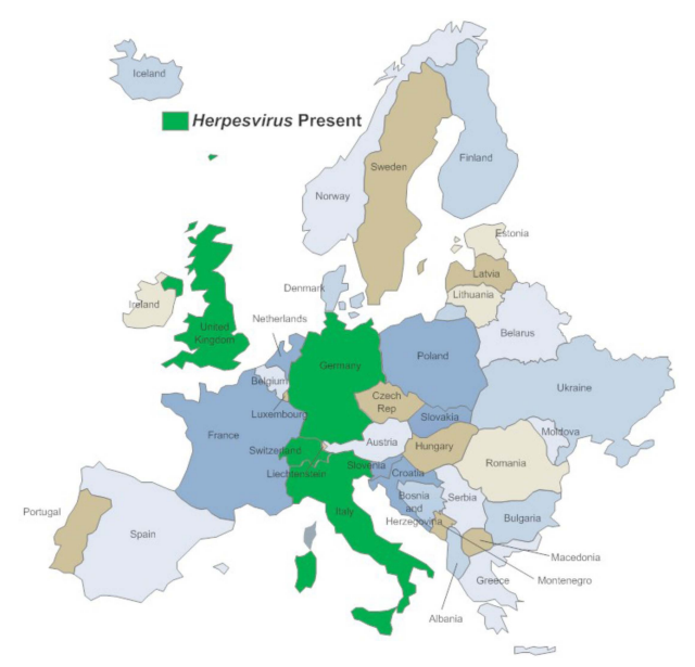
Figure 5. The distribution of amphibian herpesviruses in wild European amphibian populations.

It is thought that amphibian herpesviruses are widely distributed in Europe (Garner et al., 2013); however, they have received relatively little attention in the literature and therefore we cannot determine its status as emergent, although reports appear to be on the rise. The first disease associated with herpesvirus-like particles in an amphibian species reported in Europe occurred in the early 1990s and was published by Benatti et al. (1994). They reported herpesvirus-like particles in agile frogs ( Rana dalmatina ) from Italy suffering from herpes-like lesions. However, the outbreak was not accompanied by a mortality event (Benatti et al., 1994). Subsequently, amphibian herpesviruses have been reported in Germany,