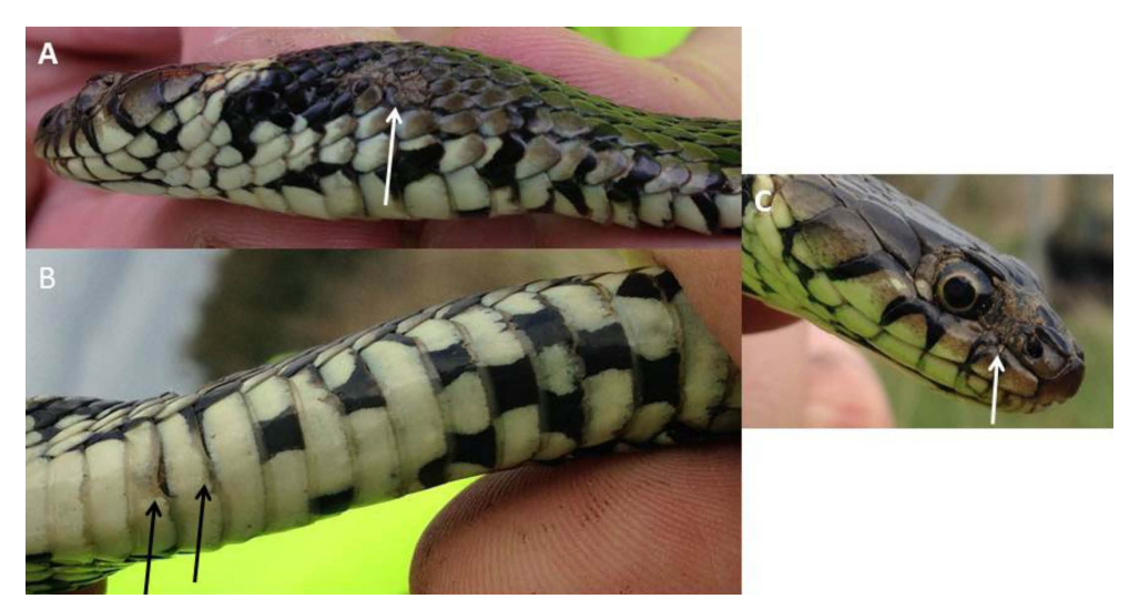
Figure 9. A barred grass snake ( N. helvetica ) in from the UK with suspected ophidiomycosis. ( A ) Arrow indicates the 'crusty' scales that are common in snakes suffering from ophidiomycosis. ( B ) Arrows indicate some of the deformed scales frequently seen in snakes with ophidiomycosis. ( C ) The arrow indicates the crusty scales on the snout.

Pelophylax spp. but some common newts (L. vulgaris; Kik et al., 2011). Subsequent investigations into amphibian morbidity and mortality events in the Netherlands has revealed that the CMTV-like Ranavirus is spreading and is the causative agent of many of the observed events (Rijks et al., 2016; Spitzen-van der Sluijs et al., 2016b; Saucedo et al., 2018). It is also important to note that these outbreaks of disease are affecting the common spadefoot (P. fuscus), which is a threatened species (Spitzen-van der Sluijs et al., 2016c). In the UK, common frog populations where ranaviruses have emerged have significantly decreased in size. Teacher et al. (2010) found that on average, common frog populations where Ranavirus was found declined by approximately 81 % when compared to populations where the virus was absent. Furthermore, Teacher et al. (2010) report that larger populations were disproportionately affected, with larger populations losing a greater number of animals to disease emergence than those that were initially smaller when Ranavirus infections emerged. The emergence of amphibian ranaviruses has also changed the population structure of common frogs in the UK, making them more susceptible to stochastic events (Campbell et al., 2018). This is cause for great concern with the ever-increasing